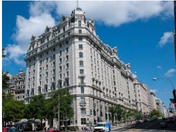
Willard InterContinental Hotel Washington, D.C.